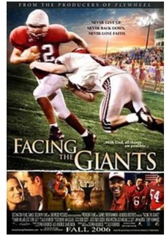
Facing The Giants