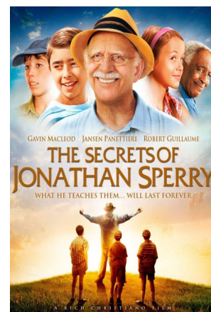
The Secrets of Jonathan Sperry